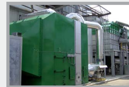
Concentration Unit for V.O.C. coming from plastic components painting