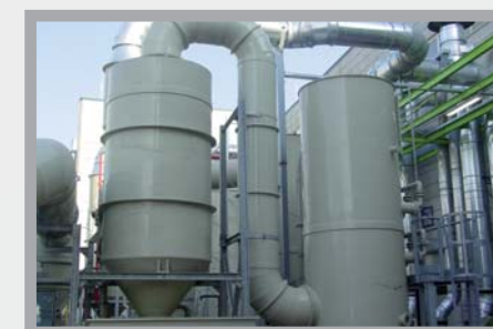
Scrubbers for acid or basic vents