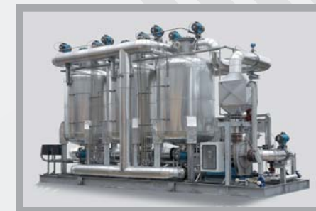
Halogenated V.O.C. adsorption on activated carbons with inert gas regeneration