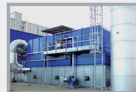
RTO for V.O.C. exhaust from alucans lining