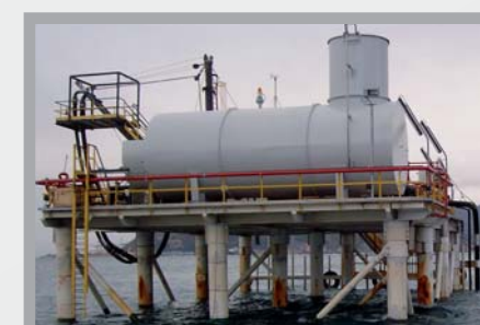
Exhaust incineration of gasoline vapours