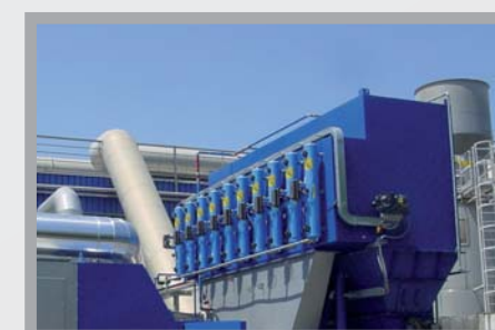
Dry dedusting Unit for air dust