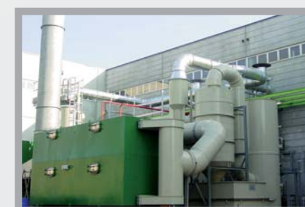
Scrubbers for inorganic wet absorption and final stage of V.O.C. cleaning by using activated carbon