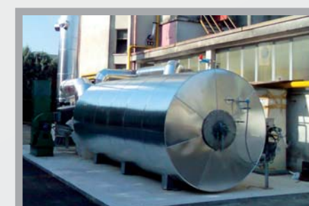
Recuperative Thermal Oxidizer with integrated heat exchanger